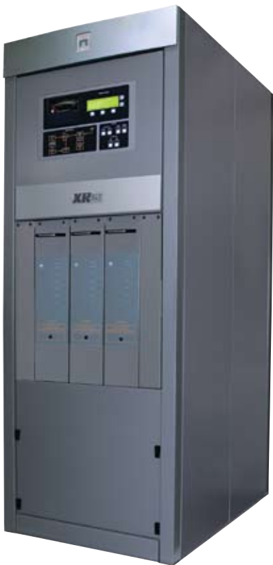
XR12 AM Digital Transmitter

The XR12 is purposely designed for demanding AM broadcast applications that require reserve power. This extra power overcomes antenna system losses such as those encountered in complex directional arrays. It allows aggressive audio processing and high levels of asymmetrical modulation to produce more sideband energy and a stronger signal. Extra power also makes it possible to maintain full power AM transmission while also transmitting a digital signal or other simultaneous phase-coded data.