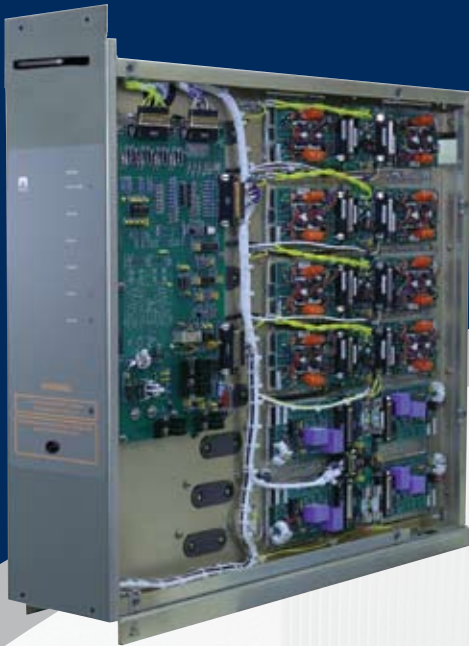
XR Series Power Module